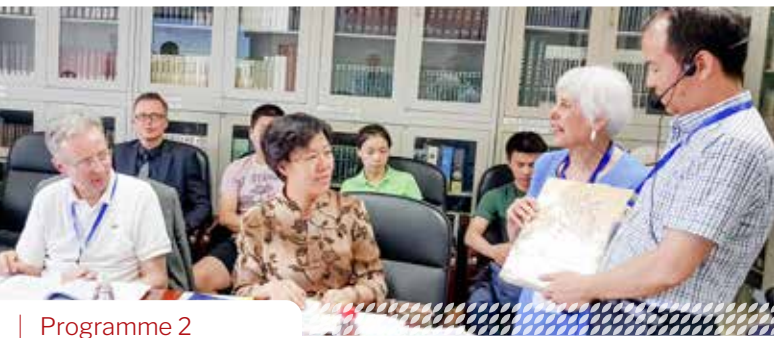
| Programme 2