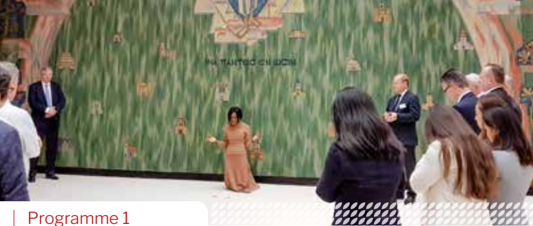
| Programme 1